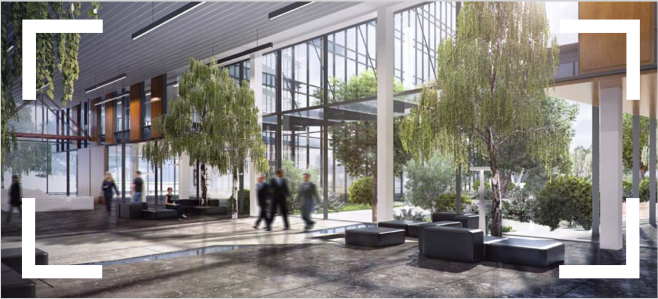
* The images presented herein are purely illustrative and should not be taken as indicative of the completed project's appearance.